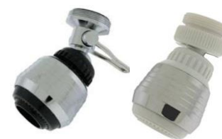
Swivel Spray Aerators