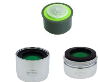
Regular & Junior Aerators