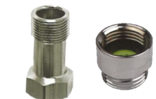
Supply Line Flow Control